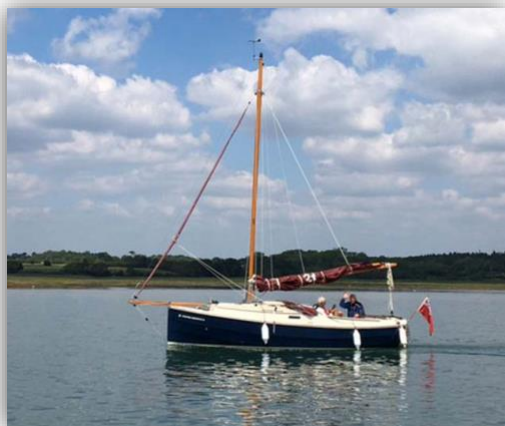
Amigo in the Beaulieu River