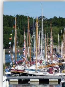
All dressed up