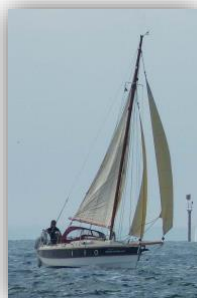
YoYo off Ryde, en route to Beaulieu