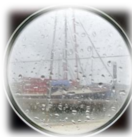
An unwelcome change in the weather on our 2 nd day in Bembridge