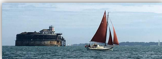
Lady Mary approaching Bembridge through the Forts