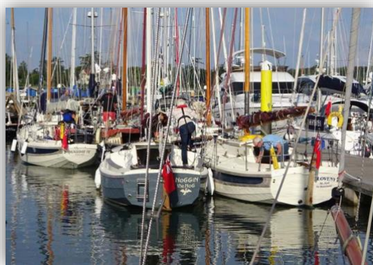
Preparation for homeward journeys