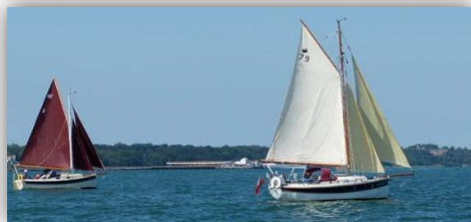
YoYo and Tressa off Ryde, en route to Beaulieu