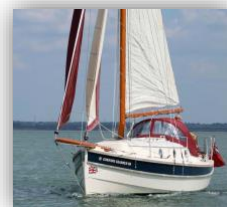
Chris and Sue on Creekability 2 approaching Beaulieu