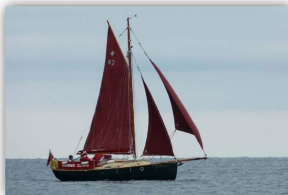
Moore's Claws en route from Chichester to Portsmouth