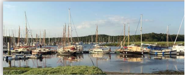
The Crabber fleet on the Bucklers Hard visitor pontoon