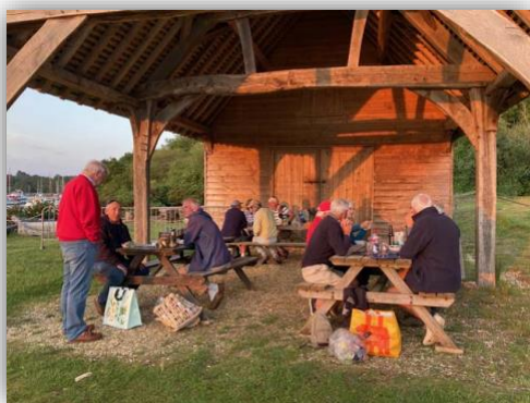
Bar-B-Q at Bucklers Hard