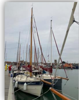
Tucked up in Yarmouth