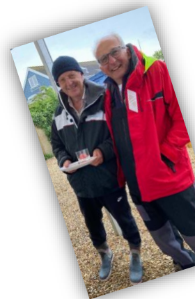
Summer Solstice Barbeque