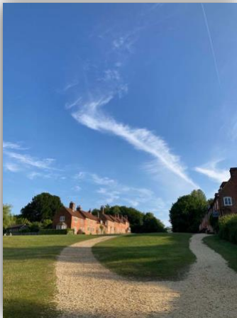
The old village at Bucklers Hard